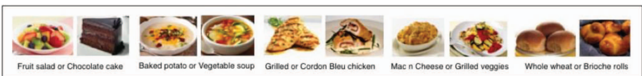
Figure 4. Food stimuli used in Experiments 2–4. See the online article for the color version of this figure.

Effects on the type of the main dish chosen. A binary logistic regression with dessert presentation order and dessert type as independent variables and main dish choice (“lighter” or “heavier”) as the dependent variable revealed a significant interaction between dessert presentation order and dessert type, Wald \chi^2(1) = 4.03 , p < .05 . In particular, whereas 55.8% of participants chose the lighter main dish in the indulgent dessert first condition, only 44.2% of participants chose the lighter main dish in the healthy dessert first condition, Pearson's \chi^2(1) = 8.63 , p < .01 . There were no significant differences between the indulgent dessert last (48.8%) and healthy dessert last (51.2%) conditions in terms of lighter main dish choice, Pearson's \chi^2(1) = .02 , ns . Further, there was no difference in lighter main dish choice when the indulgent dessert was positioned first (53.3%) versus when it