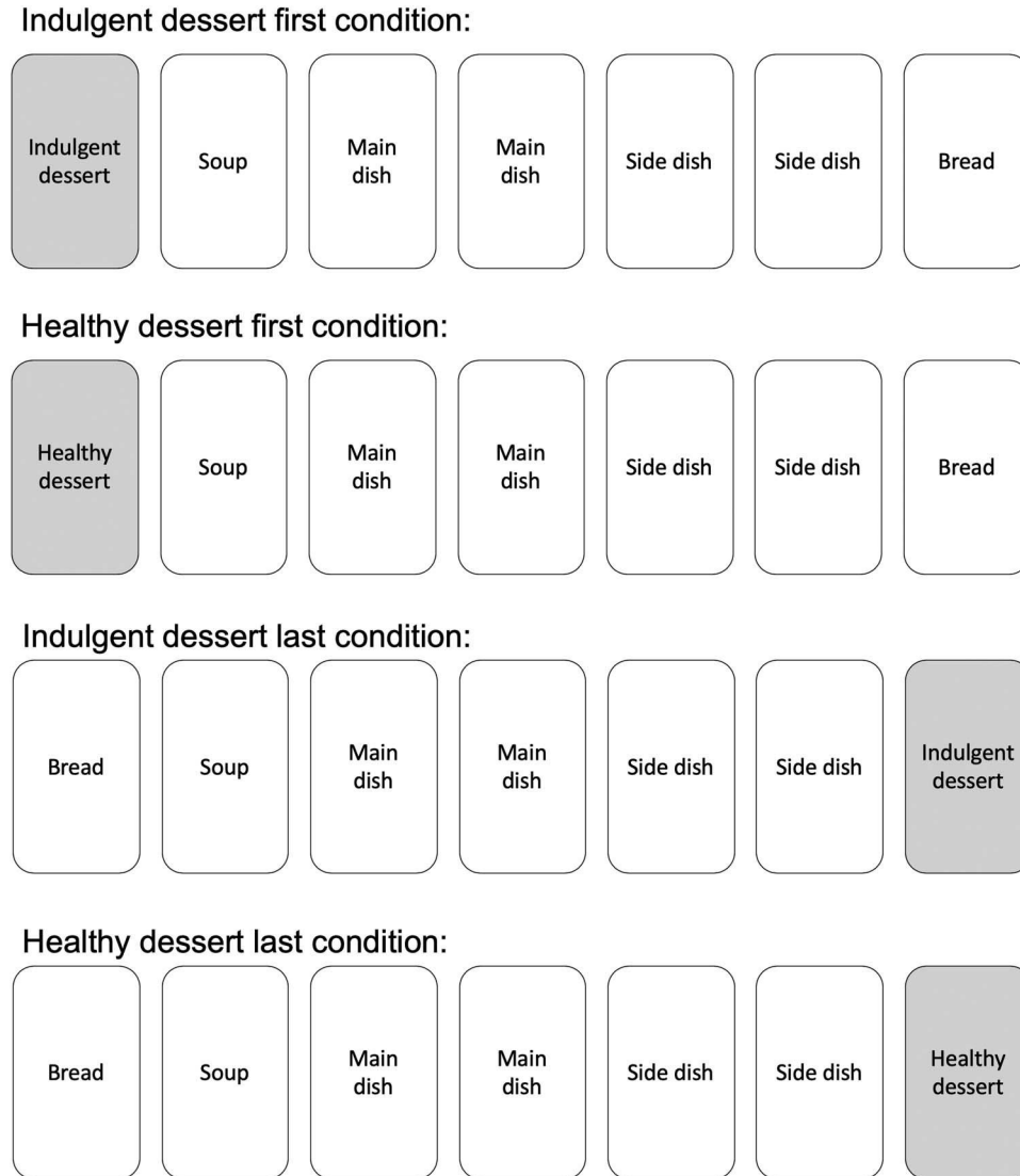
Figure 2. Four conditions used in Experiment 1.

eating ( \alpha = .75 ). We also asked participants to rate whether they were on a diet, whether they smoked, and whether they exercised on 7-point Likert scales (1 = strongly disagree ; 7 = strongly agree ). Finally, participants reported their age, gender, height, and weight.